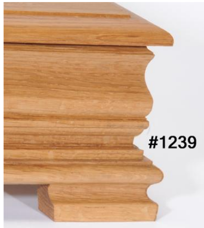
#1239 or #8585