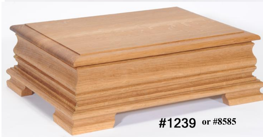
#1239 or #8585