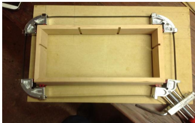
Merle Multi-Corner Clamp

Before glue up and assembly of the box body, make sure to give the interior a good sanding. This is imperative because it will be very difficult to do so after assembly. With the interior sanded, the box can be glued up. Before applying any glue, roughly expand the Merle Clamp band to a size that is just slightly larger than the overall length and width of the box. Position the adjustable corners in their approximate locations along the steel banding. The pivoting corner inserts can be removed from the Merle Corner clamp to help you produce a square glue up or left in place, as long as you check for square after the clamp is tightened. Apply glue to mitered ends and assemble the box. A piece of masking tape can act as a second set of hands to hold the pieces together as you fit each corner together. Place the box into the clamp and turn the handle to apply enough pressure to hold the parts together, making sure the corner profiles are matching up properly. Once you have all four corners secured, check the box to make sure it is square and make any adjustments needed to maintain a square box. At this point it is safe to put the box body aside and allow the glue adequate drying time.