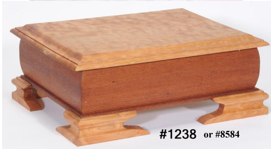
#1238 or #8584